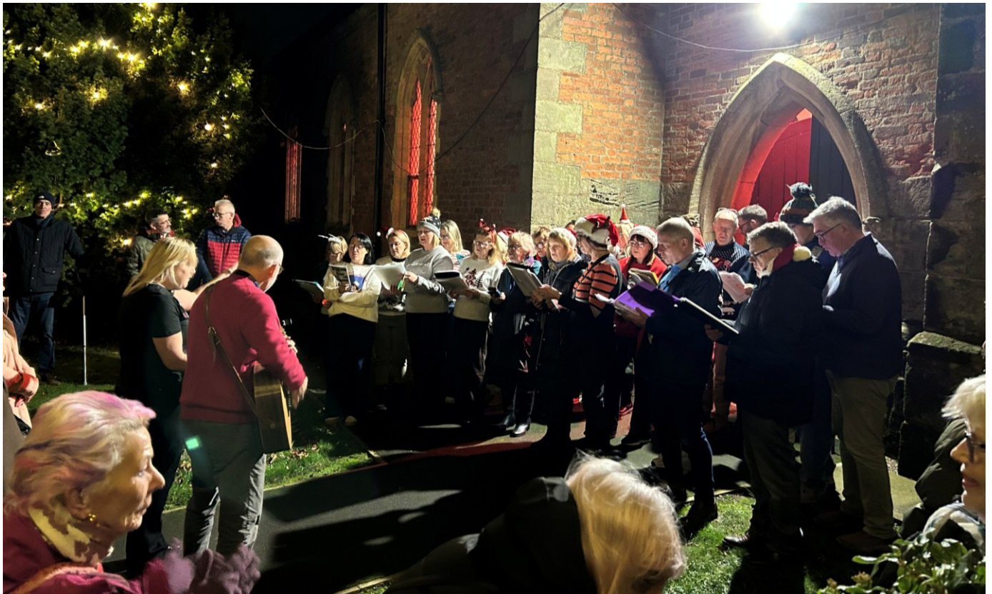
Carlton Rock Choir – Christmas Lights Switch-on 2025

Carlton News is put together and delivered by volunteers and is attracting articles on local issues by parishioners. Local walkers help to keep our public rights of way clear of obstructions and accessible. These groups are all supported by the Parish Council and without this willing labour we would have to employ contractors paid for out of the council tax.