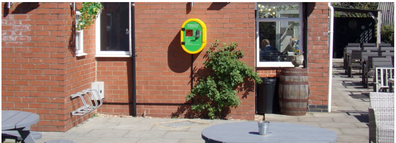
New defibrillator at The Gate Hangs Well